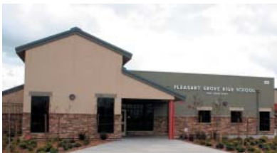
Pleasant Grove High School Elk Grove, CA

Weiss said teachers “hit the ground running,” and needed practically no training. An initial demonstration was well attended, but only a few teachers showed up for the actual training. Why? The teachers felt the brief introduction provided all they needed to know to use School Loop effectively. “After the first demonstration, School Loop was intuitive enough; the teachers figured it out on their own,” said Weiss.